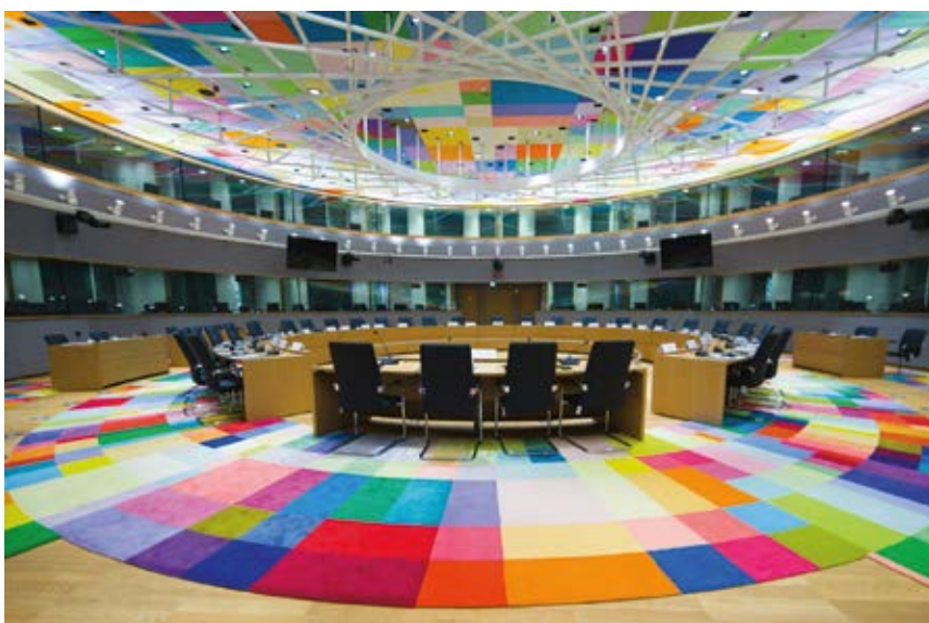
Room hosting the meetings of the European Council, in the Europa Building, Brussels, inaugurated in December 2016.

Now is the time for all Europeans to show leadership.