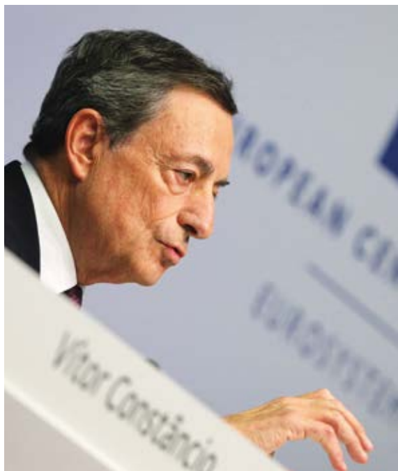
Mario Draghi, President of the European Central Bank, during a press conference.